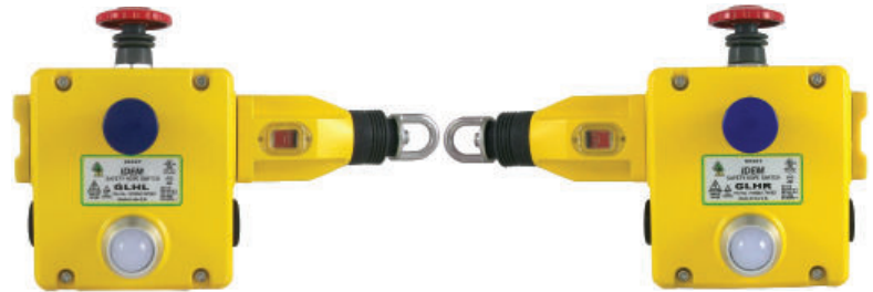
GLHL (Left Hand)