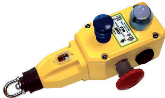
GLS-FZ: Special low temperature version -40C available.

Rugged internal sealing bellows means the GLS can be high pressure hosed and choice of materials makes them suitable for internal or external use.